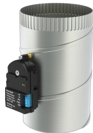
R80DV-XX Round Damper, Variable Position, Wired. Unsealed. XX diameter from 6 to 20 inches.