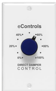
Model MWC Wired Manual Wall Control.